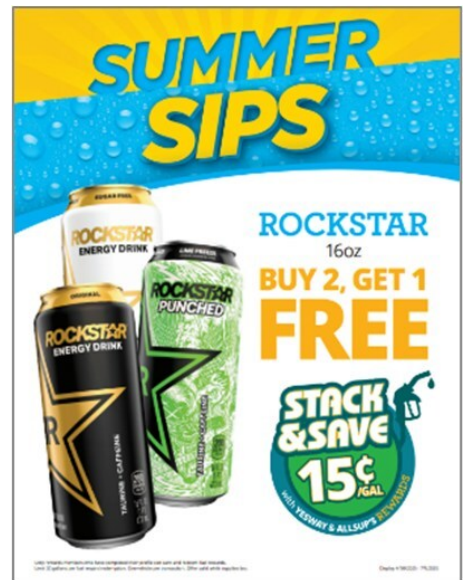
Buy 2 16oz Rockstar Energy drinks, Get 1 Free, plus 15¢ off per gallon in fuel rewards.