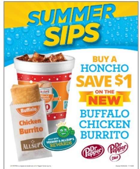
Save $1 with the purchase of the new Allsup's Buffalo Chicken Burrito and any Honcho beverage.

To find the nearest Yesway or Allsup's store, please visit Yesway Locations or Allsup's Locations .